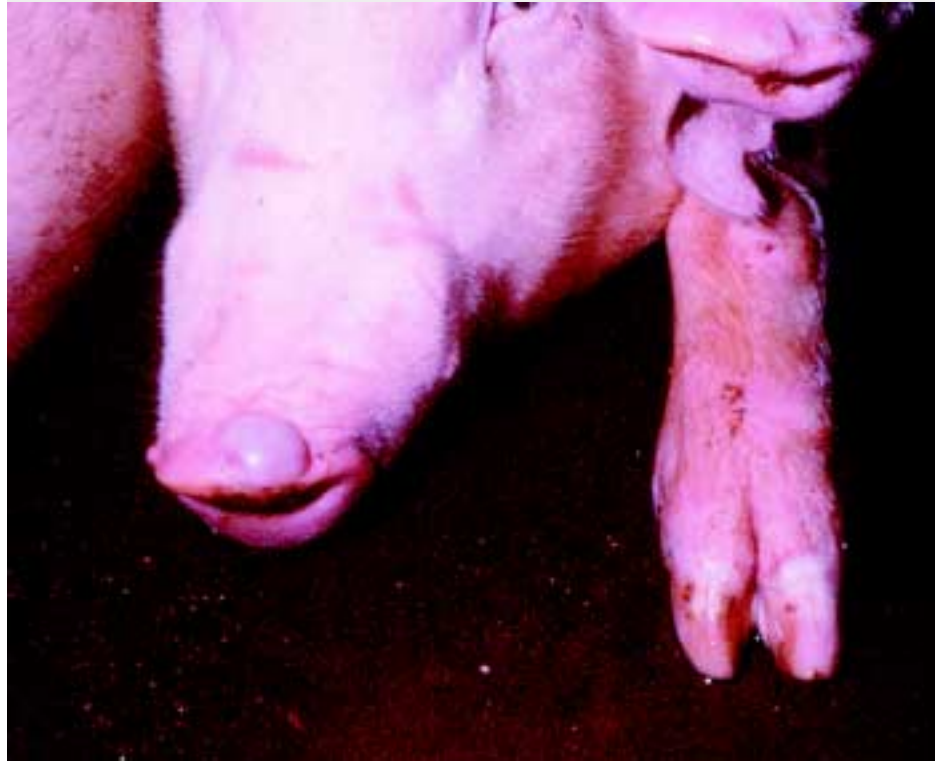
Figure 1: Pig with fully-developed snout vesicle and blanched coronary bands, indicating early vesicle formation, 48 hours after experimental infection.

identified (A, O, C, SAT1, SAT2, SAT3 and Asia1) and are distributed in different geographic regions of the world, although with recent spread, these geographic distinctions are becoming blurred. 4 All cloven-hoofed animals are susceptible to infection with FMDV. Experimental and (or) natural infection has been recorded in a number of other species, including elephant, capybara, hedgehog, armadillo, and mouse. 4 The vast majority of FMDV strains have demonstrated capability of infecting a very wide host range. However, in Taiwan in 1997, when a vesicular disease in pigs emerged, FMD was initially discounted because