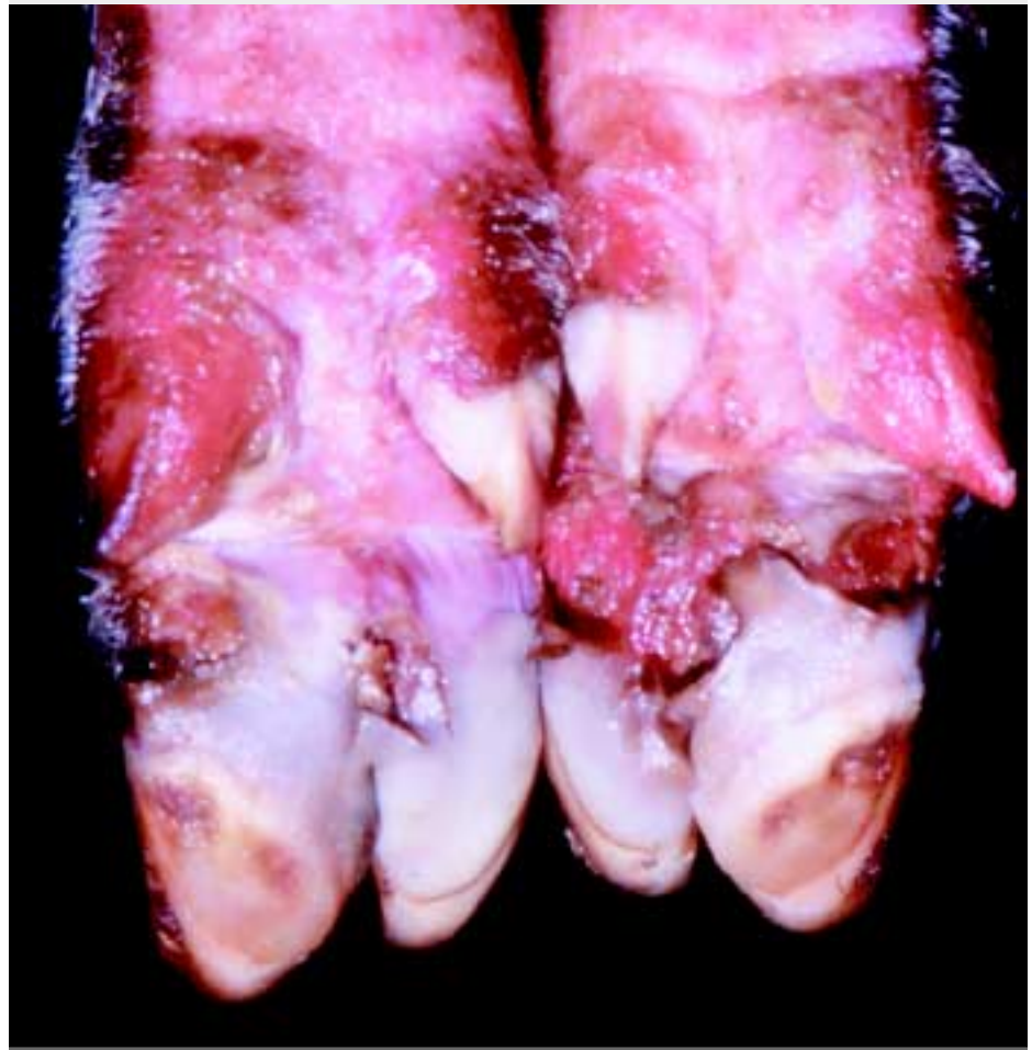
Figure 2: Severe erosions and ulcerations around the coronary band of a pig, with early sloughing of the claw, 96 hours after infection.

It is not possible to diagnose FMD solely on the basis of the gross or histologic appearance of the disease. Grossly, all diseases causing oral, snout, pedal, or teat erosions should be considered in the differential diagnosis of FMD. Histologically, all vesicular diseases (FMD, swine vesicular disease, vesicular stomatitis) have similar morphologic characteristics and even in the vesicular stage cannot be differentiated from one another microscopically. All are characterized by intra- and intercellular edema in large groups of cells within the stratum spongiosum. Once the vesicles have ruptured, the histology of vesicular diseases is very similar to many erosive and